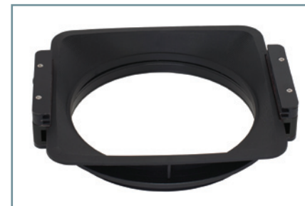
The SW150 MKII filter holder comes assembled with two filter slots and a Lightshield.

The SW150 Mark II filter holder comes fitted with a Lightshield. The shield helps to prevent unwanted back reflections and creates a light tight seal enabling the use of both the Little and Big Stopper. Photographers who already own the SW150 Mark I can purchase the Lightshield separately and retro fit it to their existing SW150 filter holder.