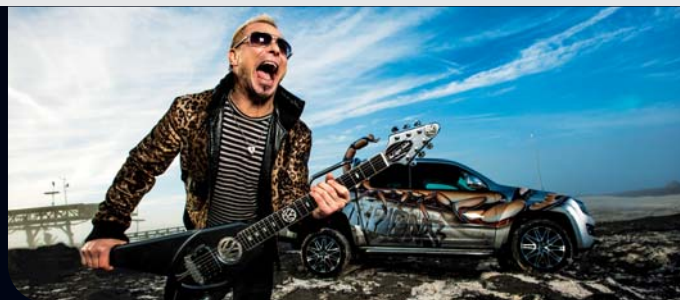
photo // nikolai georgiew shoots rudolf schenker for vw commercial vehicles // www.georgiew.de

You can connect up to 3 flash units of the Integra Mini, Integra Plus or Expert D series (combined up to 2000 J) simultaneously. An intelligent protective circuit ensures the device's safety and an easily legible load display keeps you informed about the operating status.